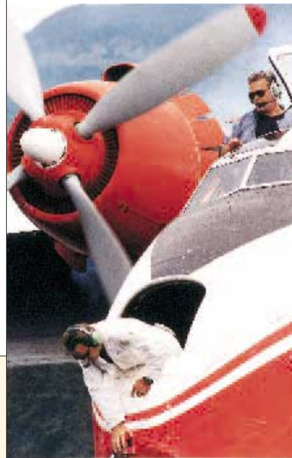
MARS PHOTOS: ROB LENTZ

DID YOU KNOW? Wind patterns can change at different elevations, so foresters have to plan for this. Winds can also gain maximum speed in an opening only four tree-lengths in diameter, so where windthrow is expected, foresters create smaller openings or feather the edges to protect trees on the perimeter.